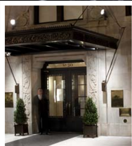
WORDS: DANIELLE OPPERMANN

Starting this issue, delicious. will offer you a glimpse inside the best hotels, from the latest openings around Australia to addresses in the world's most exciting cities. And what better place to begin than New York, where a recent refurbishment of The Surrey has seen it transformed into a plush destination worthy of its Upper East Side location. With a restaurant by one of the city's hottest chefs, a glamorous cocktail bar and Madison Avenue shopping around the corner, it's a true taste of Manhattan's high life.