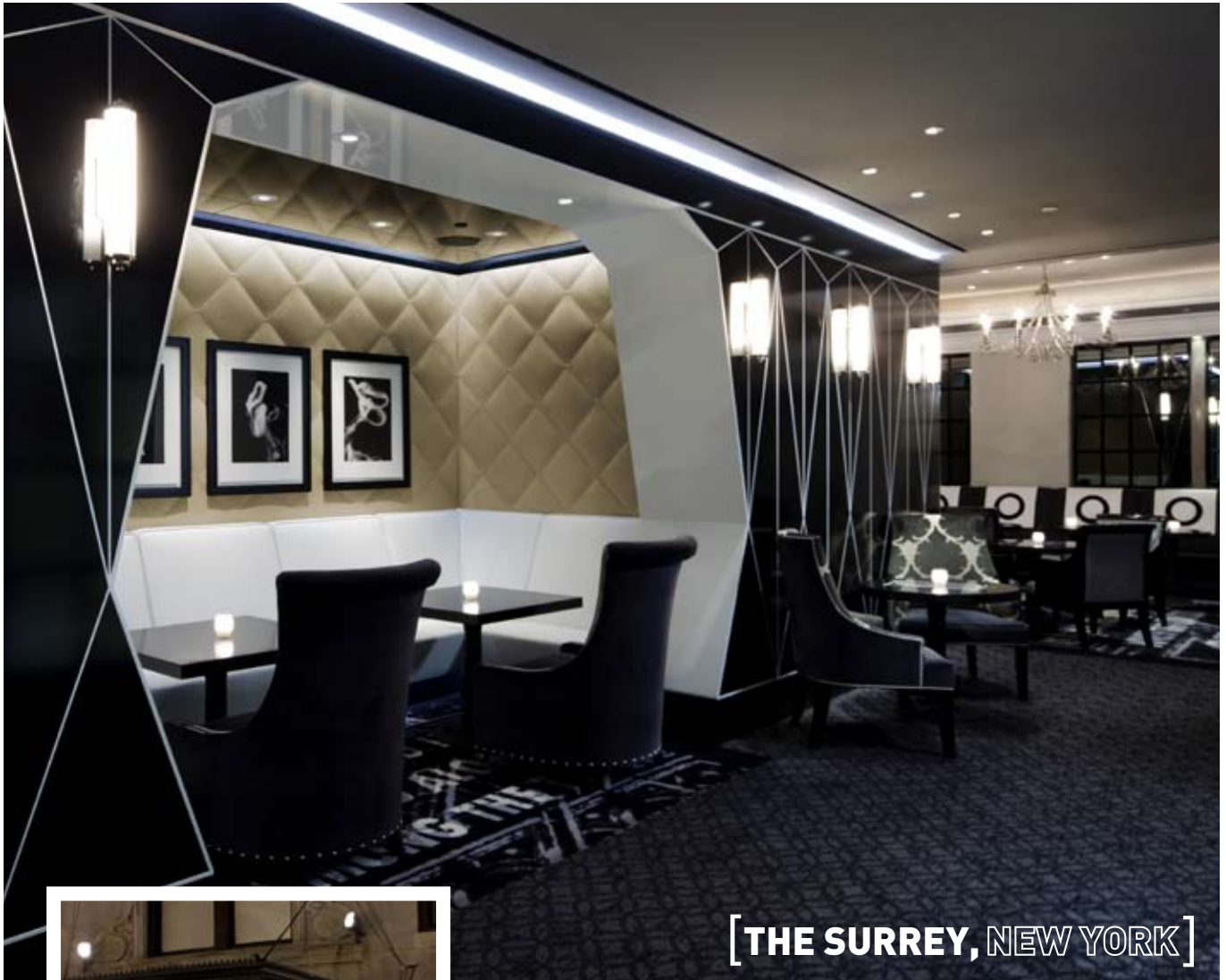
[THE SURREY, NEW YORK]